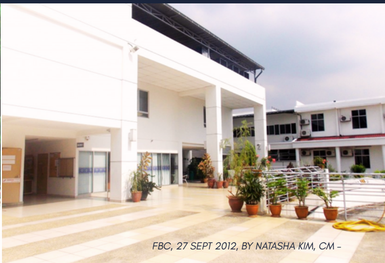
FBC, 27 SEPT 2012, CM

Over the next few years, to raise funds for the church building, the church members made and sold kuih kapit, and peanut cookies, as well as printed and sold Christmas and Hari Raya cards by the thousands. By the grace of God, they managed to raise an impressive RM300,000 - enough to fund the church building, as well as to furnish and install air-conditioning for the church.