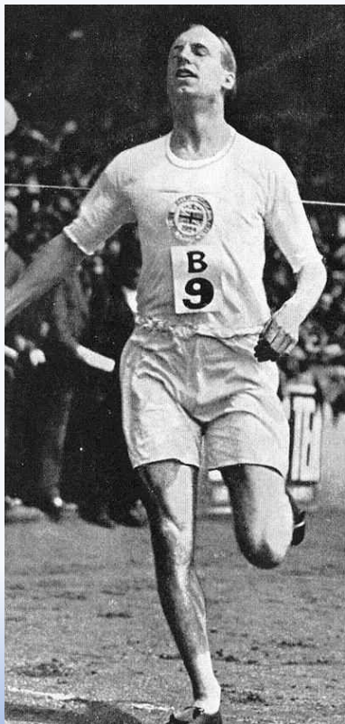
Eric Henry Liddell