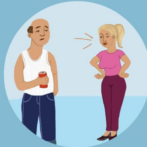
Lack of respect