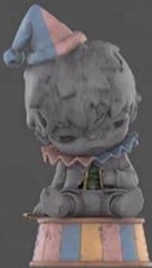
失乐园 PARADISE LOST