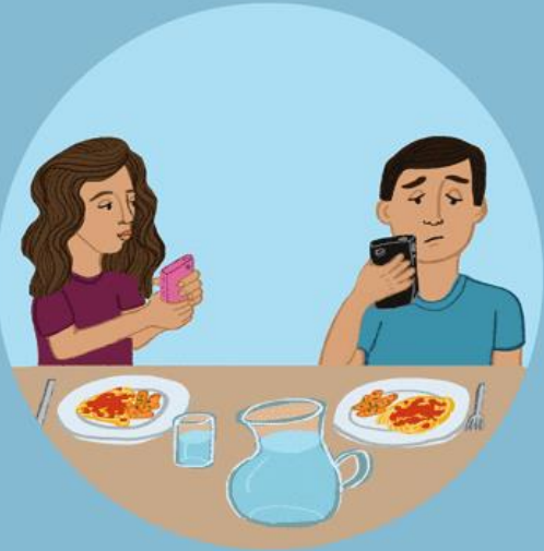
Lack of communication