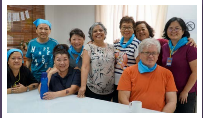
Blossom (Snack Team)

Praise God for the opportunity to serve in the kitchen for the SS Bible Camp. It was a wonderful learning experience to see the operation of running the Camp over the two days together with the other Snack Team mates.