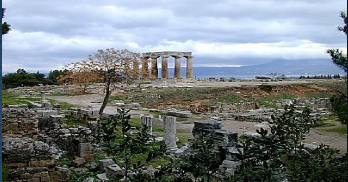
Temple of Tyche