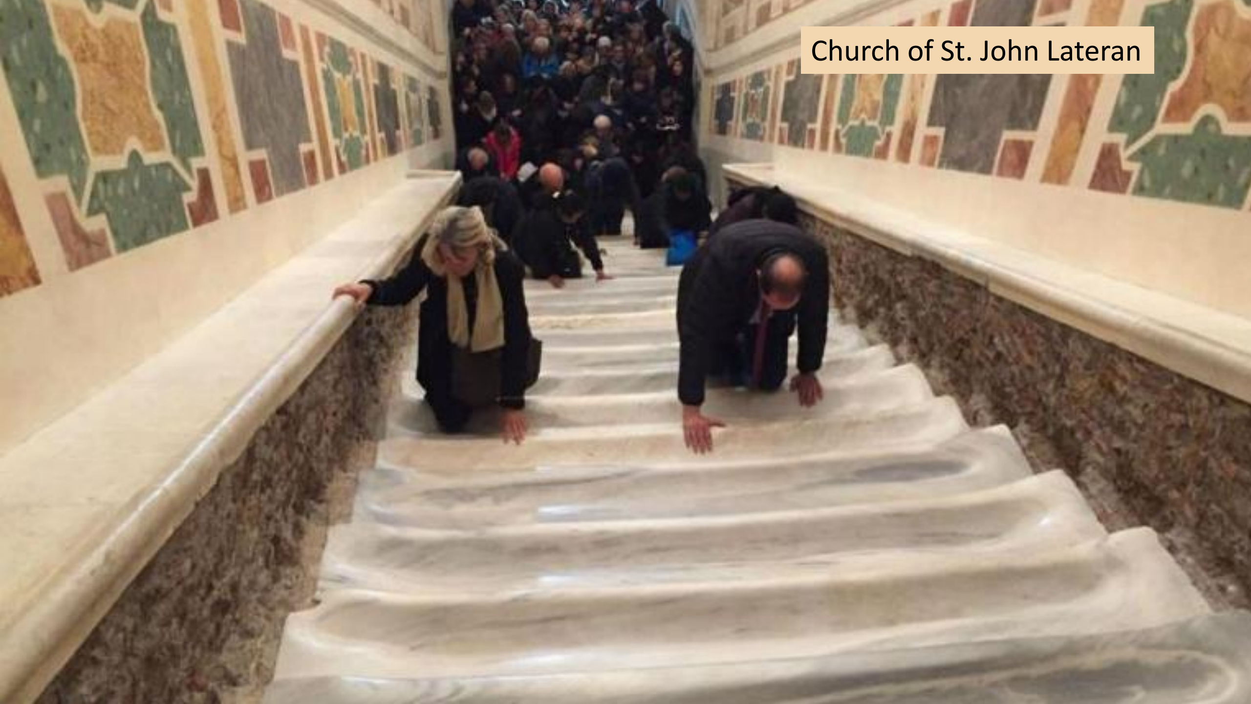
Church of St. John Lateran