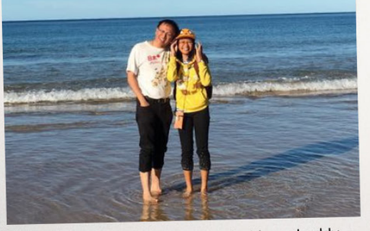
My partner in crime, my movie-binge buddy, my hiking and breakfast friend. Blessed Father's Day dad, thank you for all the love and knowledge you've given me.