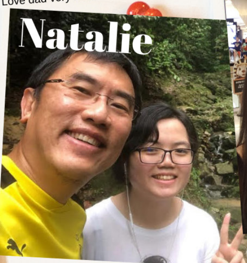
No one in this world can love a girl more than their dad. Happy Father's Day!

Dear Dad, thanks for everything you have done for this family.