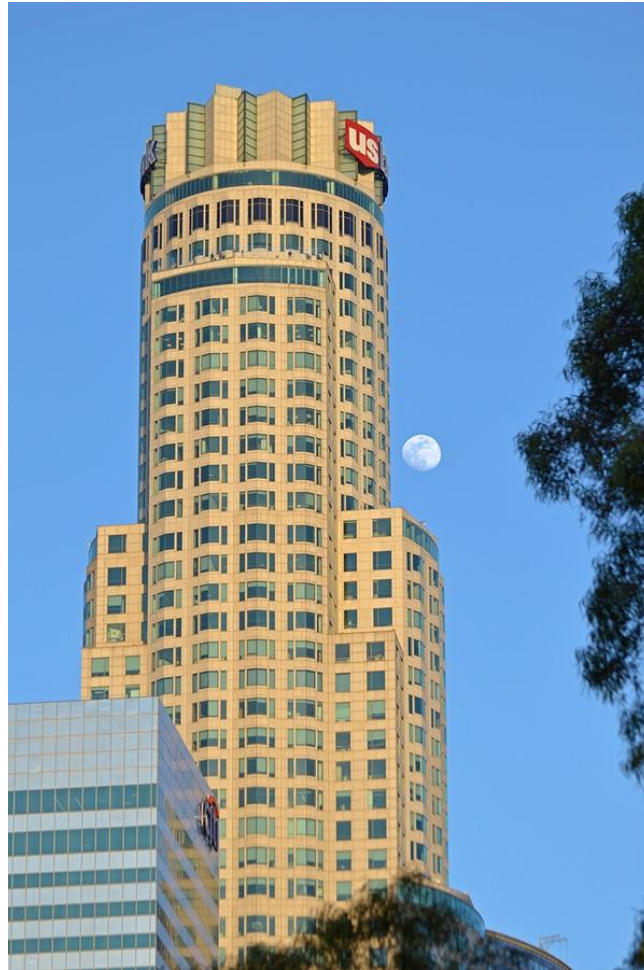
US Bank Tower