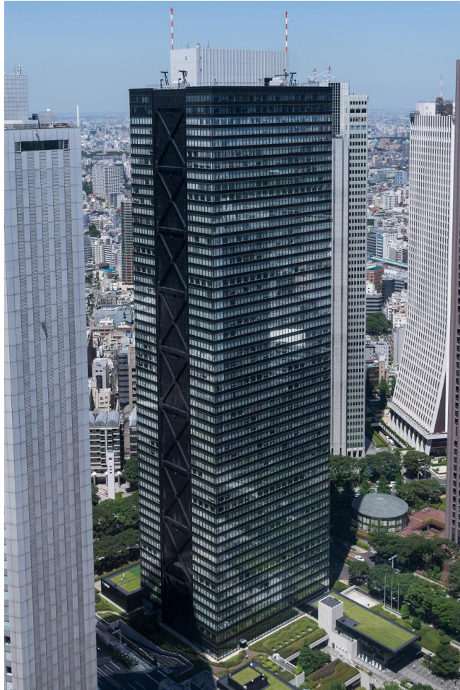
Shinjuku Mitsui Building