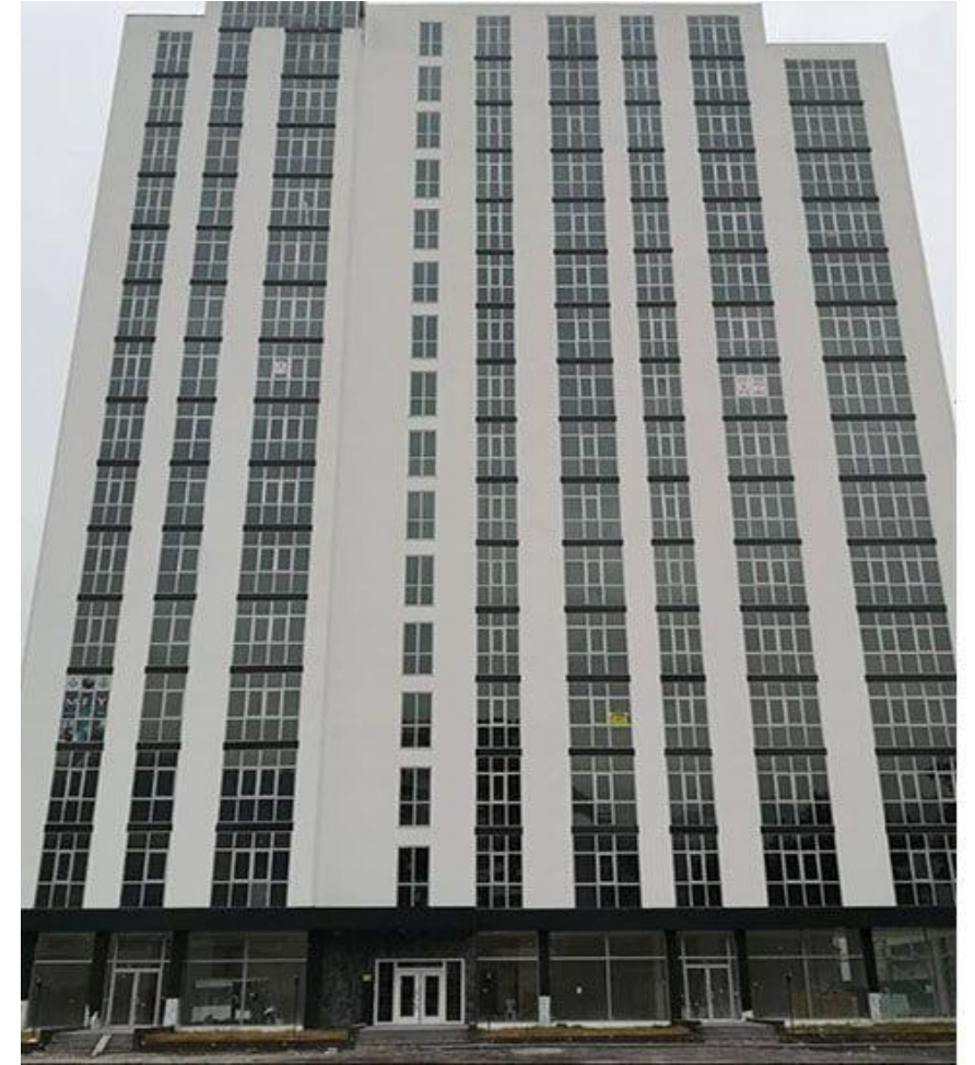
Building in Turkey