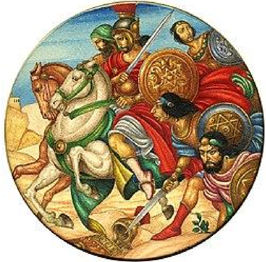
1927, Bar Kochba, watercolor and gouache on paper, Arthur Szyk