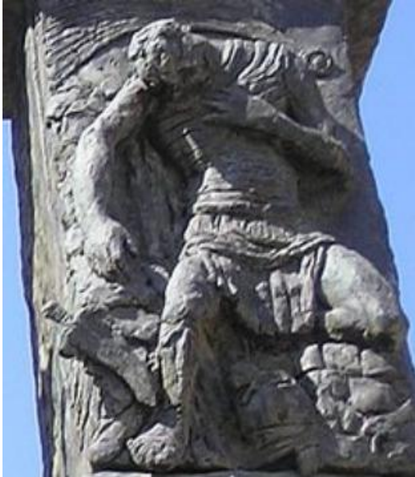
Simon bar Kokhba