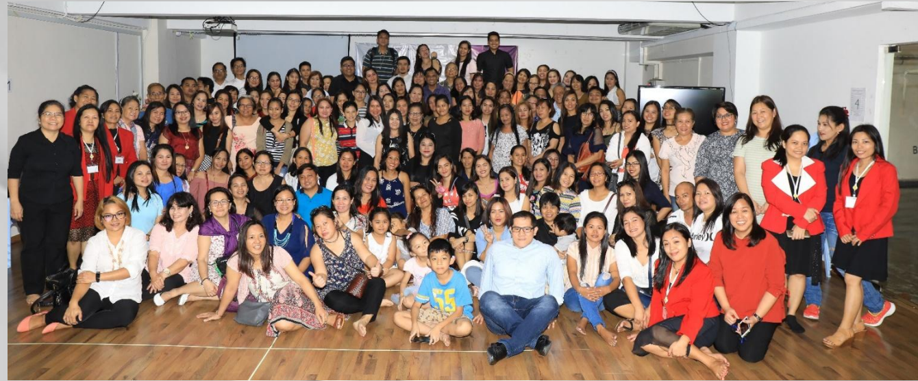
5 th Anniversary