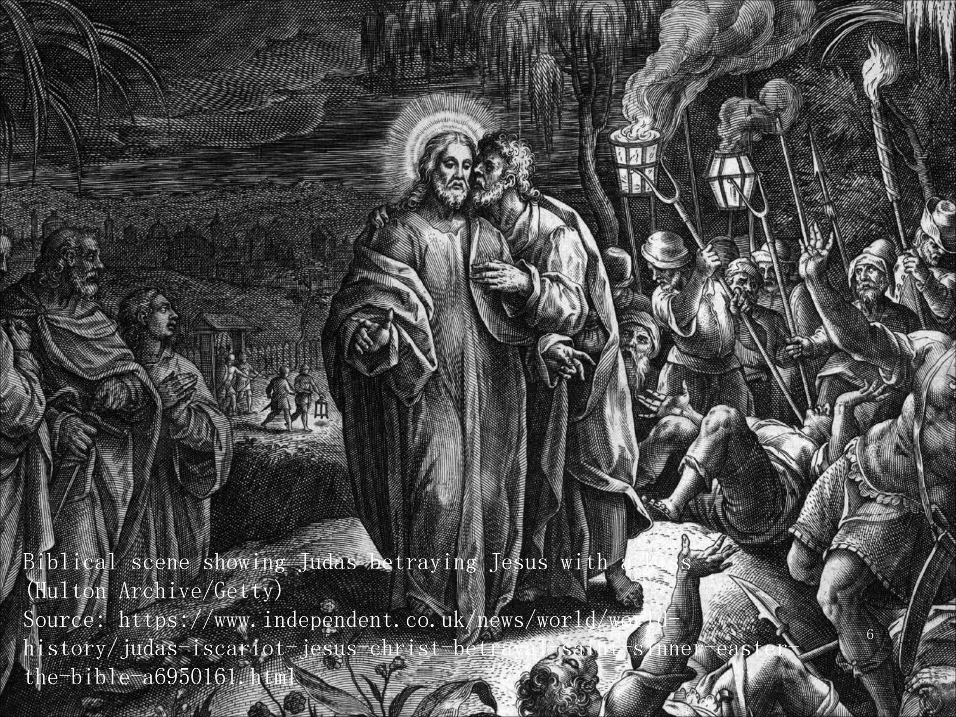
Biblical scene showing Judas betraying Jesus with a kiss